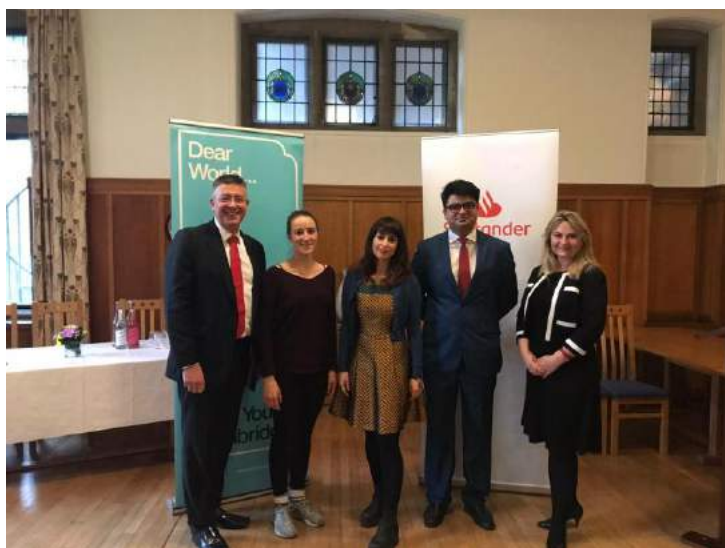
Some of the St Edmund's recipients of Santander funds